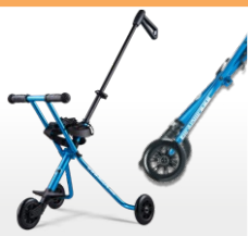
18 MONTHS +