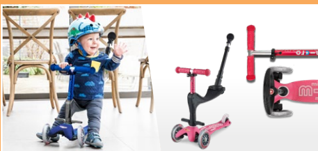
MICRO 3-IN-1 DELUXE PUSH ALONG